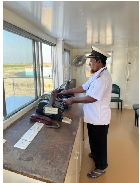
Proud captain of the ship