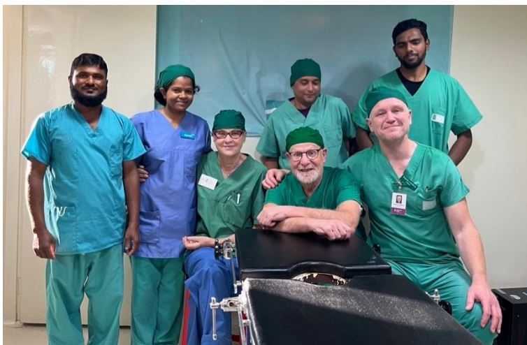
The operating team